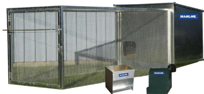
Chook house, Steel Pellet Feeder, and Water Trough